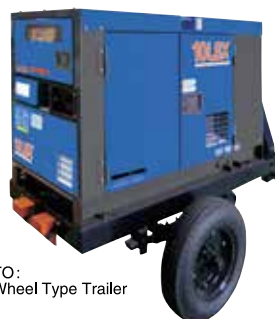
PHOTO: Two Wheel Type Trailer

Trailers can be fitted to the generators to facilitate on-site movement.